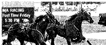
I KNOW MY CHIP